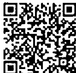
TOBIAS READ, SECRETARY OF STATE Issued Date: 1/20/2025

Come visit us on the internet at: https://sos.oregon.gov/business or use the QR code to check their current status.