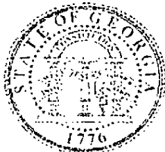
Brad Raffensperger Secretary of State

Docket Number : 27815737 Date Inc/Auth/Filed: 02/09/2017 Jurisdiction : Georgia Print Date : 08/12/2024 Form Number : 211